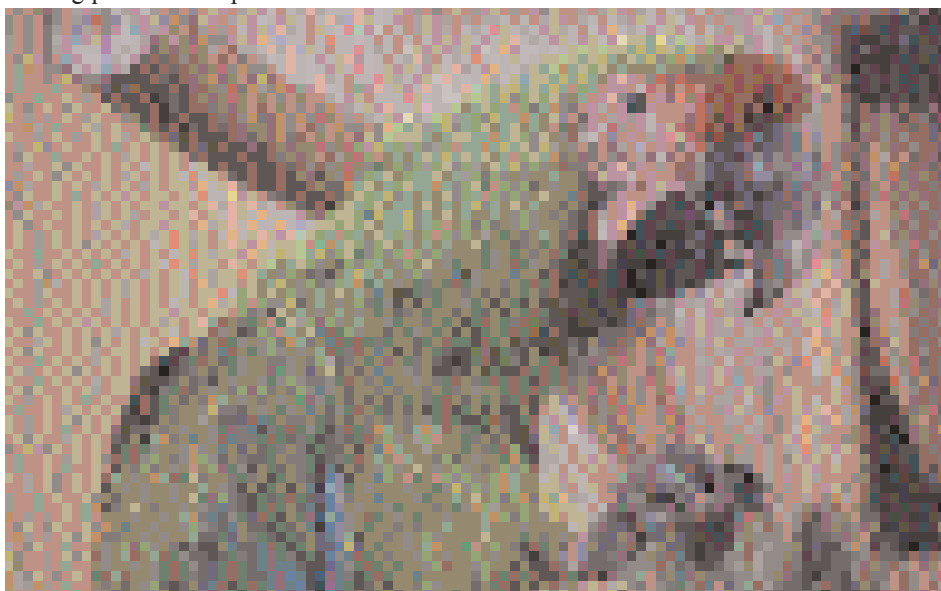
Great Green Macaw.

Our efforts to focus attention on this area have recently taken on added meaning because the last remaining nesting habitat for the species in Costa Rica (estimated to be less than 10% of its original range) is located in a critical juncture of the Mesoamerican Biological Corridor. The macaws' remaining breeding habitat is situated between the Nicaragua's Indio-Maíz Biological Reserve and the large conservation complex in Costa Rica that includes La Selva, Braulio Carillo National